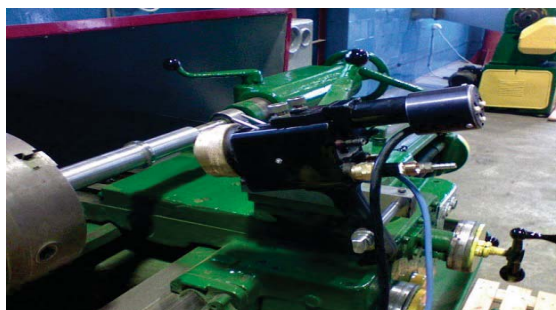
Figure 4 - Unit for EAS with a propane-air combustion chamber

The units for EAS produced by NPOOO "MAD" (Minsk) combine the advantages of electric arc and fast spraying [8-11] (Fig. 4). The main distinguishing feature of the EAS unit is the presence of an efficient small-sized chamber for propane/air mixture combustion. A fast jet of the combustion products leaves it with a speed of 1500 m/s at the outlet. The unit operates on the basis of melting wires by an electric arc and spraying molten wire droplets with the fast jet of combustion products. It requires supply of compressed air with pressure from 0.6 to 0.8 MPa and propane with pressure from 0.3 to 0.45 MPa as well as a source of welding current with a "hard" voltage-current characteristic (of the "VDU-506" type). By varying the consumption of propane and air, it is possible to create a neutral or reducing atmosphere in the melting zone of the electrode wire and thereby to weaken metal oxidation and burnout of alloying elements [8-11]. Moreover, the design features of such units make it possible to increase the velocity of sprayed material particles and the coefficient of material utilization to 0.85; herein the jet angle does not exceed 10^\circ .