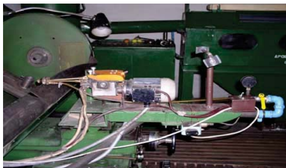
Figure 3 - Apparatus EM-14 for EAS